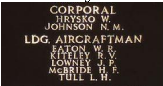
Extract From July 1945 RCAF Plaque at Ottawa Memorial